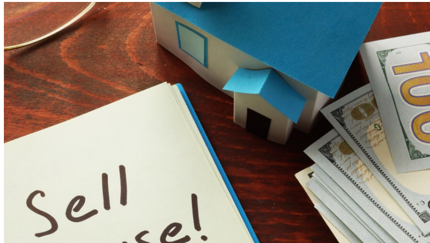
2017 Housing Market Survey SOURCE: CALIFORNIA ASSOCIATION OF REALTORS

There are many great reasons nearly 90% of sellers use a listing Agent according to the National Association of Realtors. Selling a home is time consuming, out of pocket expenses for marketing, having knowledge of neighborhood trends, and excellent negotiating skills.